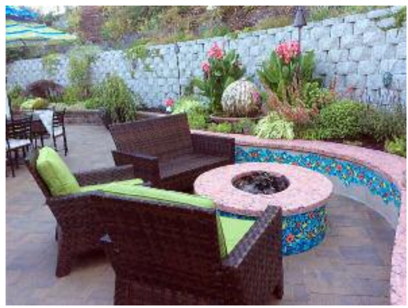
First Place winner, Small Residential Design/Build Installation: Turquoise mosaics and lime green umbrella and pillows enliven the horizontal surfaces in Darlene Davidge's yard. Although it appears to be marble, it is actually concrete.

The Davidge family, which includes grown children, finds the garden area a peaceful sanctuary. The splash of the fountain, the sights and sounds of the finches and humming birds, the smell of flowers and the sizzle of dinner on the grill makes their new yard a place they don't ever want to leave. "It's almost