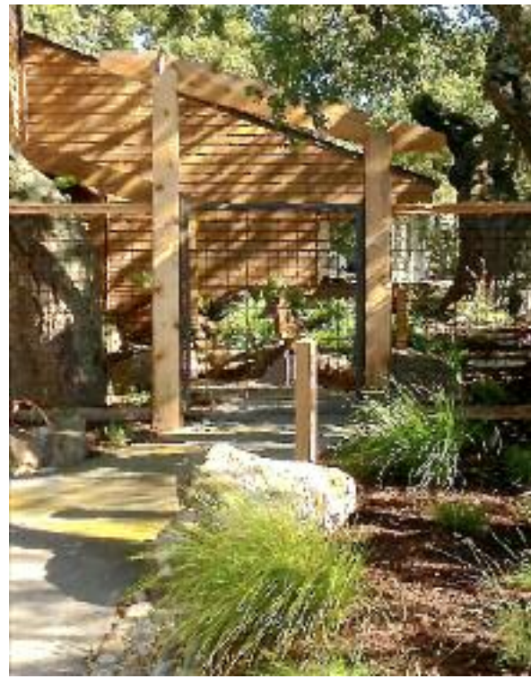
The inconspicuous fencing almost disappears visually but still keeps the deer at bay.